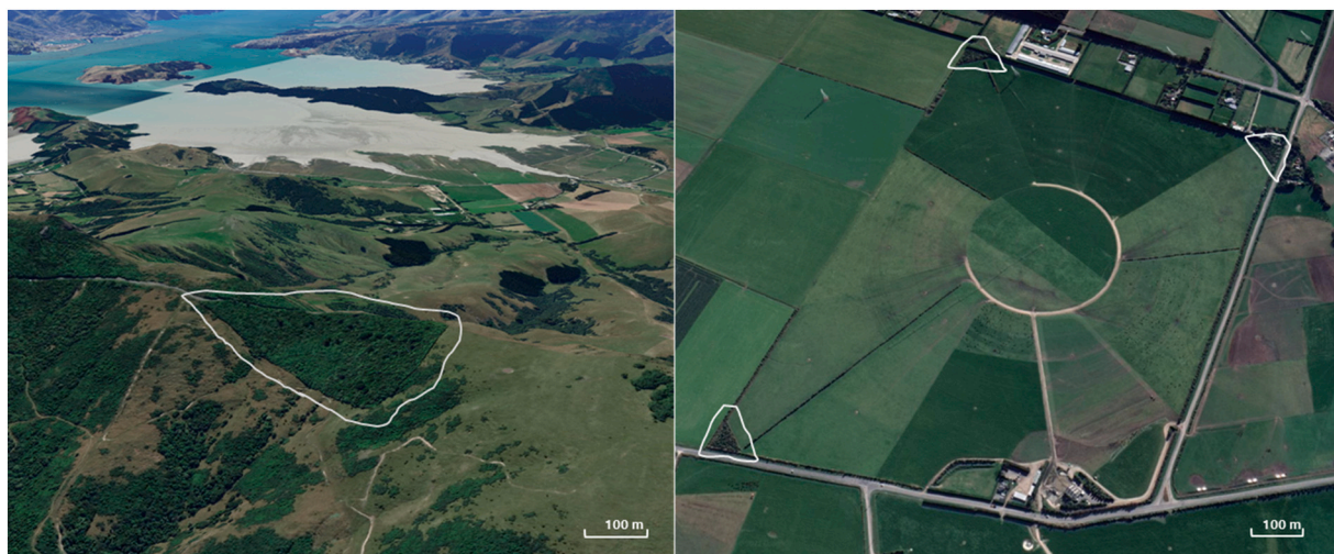
Fig. 1. Examples of marginal vegetation that provides a refuge for native earthworms within livestock-farmed landscape matrices in lowland New Zealand: Ahuriri scenic reserve (–43°39'58.97"S/172°37'26.37"E, left) and Lincoln University commercial dairy farm (–43°64'39.09"S/172°43'38.29"E, right).

Soil was thoroughly mixed and sieved with a 4 mm sieve prior to a microcosm study. As we expected, introduced species of earthworms including Lumbricus rubellus , Aporrectodea caliginosa and Octolasion cyaneum , but not native earthworms, were recorded while sampling in the sheep-farmed pastures of the present study. Earthworms were collected from sites with native and restored vegetation in the East and West Coasts of South Island (Table 1) by digging (20 × 20 × 20 cm) and hand-sorting; more than 100 individuals of each earthworm species were collected to use in this study. Native species were classified based on both morphological (Lee, 1959a, 1959b) and molecular methods, the latter using DNA barcoding of 16S rDNA regions (Kim et al., 2017a). Epigeic, anecic and endogeic behavioural groups were represented by