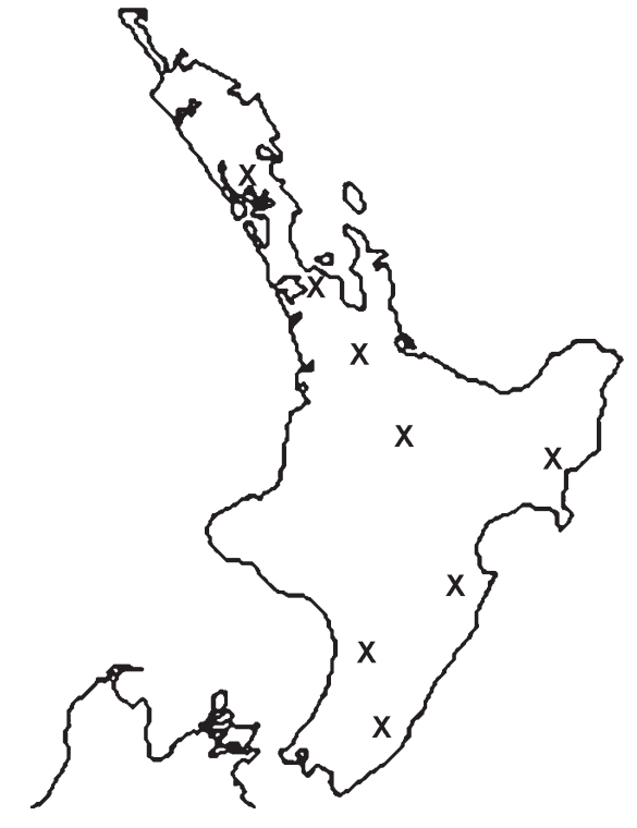
Fig. 1 Poplar sampling locations in the North Island, New Zealand.

Soil was taken from the root zone of each tree or pasture plant that was sampled. Where sampled rows were adjacent, one soil sample was taken from an intermediate position. The soil at the Aokautere Nursery is a fine sandy loam (Manawatu series) with pH = 5.4, cation exchange capacity (CEC) = 13.4 cmol<sub>c</sub> kg<sup>-1</sup>, organic carbon content of 63 g kg<sup>-1</sup>, and a resident Cd concentration of 0.3 \mu g g<sup>-1</sup>.